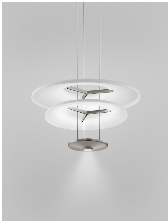
DIONE SP 2 BCST AVS L22 CE